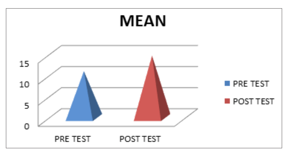
Figure 2.Represents the mean pre-test and mean post-test score