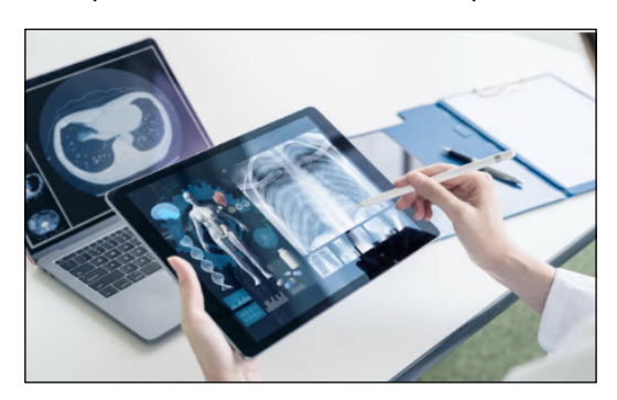
Figure I.Medical Technology Concept

Al can also help streamline administrative tasks in healthcare, such as billing and scheduling appointments, resulting in reduced administrative costs and enabling healthcare professionals to focus more on patient care.<sup>17-20</sup>